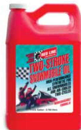
41005 Two-Stroke Snowmobile Oil - gallon 41006 Two-Stroke Snowmobile Oil - 5 gl 41008 Two-Stroke Snowmobile Oil - 55 gl