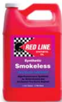
40903 Smokeless Two-Cycle Lubricant - 16oz 40905 Smokeless Two-Cycle Lubricant - gallon 40906 Smokeless Two-Cycle Lubricant - 5 gl