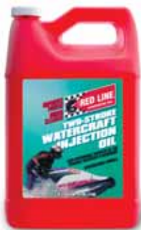
40703 Two-Stroke Watercraft Injection Oil - 16 oz 40705 Two-Stroke Watercraft Injection Oil - gallon